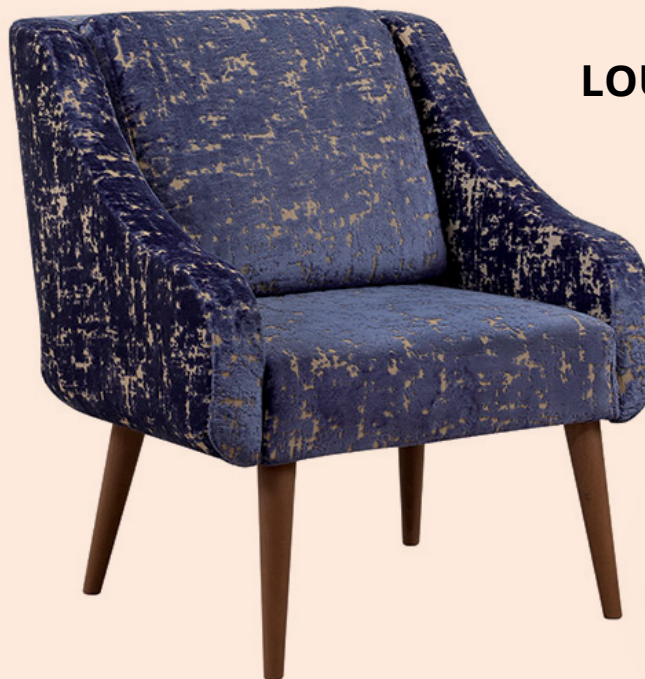
BOND LOUNGE CHAIR