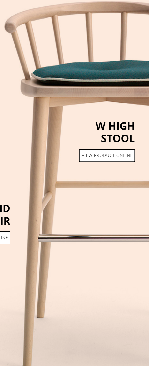
W HIGH STOOL